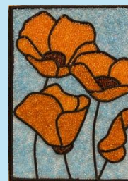
CA Poppies 5x7