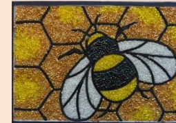
Honey Bee 5x7