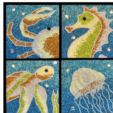
Sea Life set of 4

Level 3 – More freeform bead blending, accent pieces, colored Art Edge, free hand cutting techniques