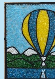
Dream Ride 5x7