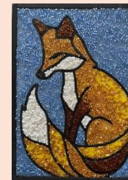
Willow (fox) 5x7

Level 2 – more lines, blending of bead colors, a bit more time consuming