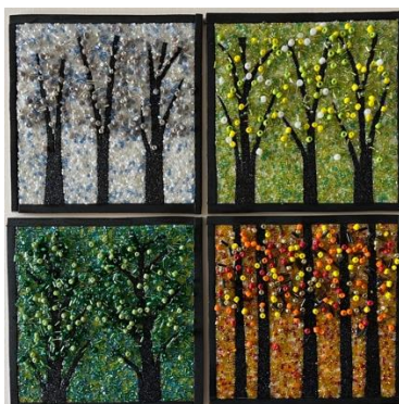
4 Season Trees